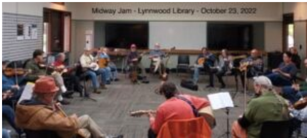
District 16 Members Meeting and Jamming at the Lynwood Library

Our next WOTFA Midway Jam will be Sunday, December 11, 1:30-4:00 pm , at the Lynnwood Library (19200 44th Ave W, Lynnwood) on Sunday. We have a great time playing fiddle tunes, bluegrass tunes, some swing tunes and being challenged with new tunes. Feel free to ask other musician friends to join us. We are thankful to the Lynnwood Library for freely welcoming us to use this great room. Other districts might want to check in with their local libraries to see if a room is available without cost.